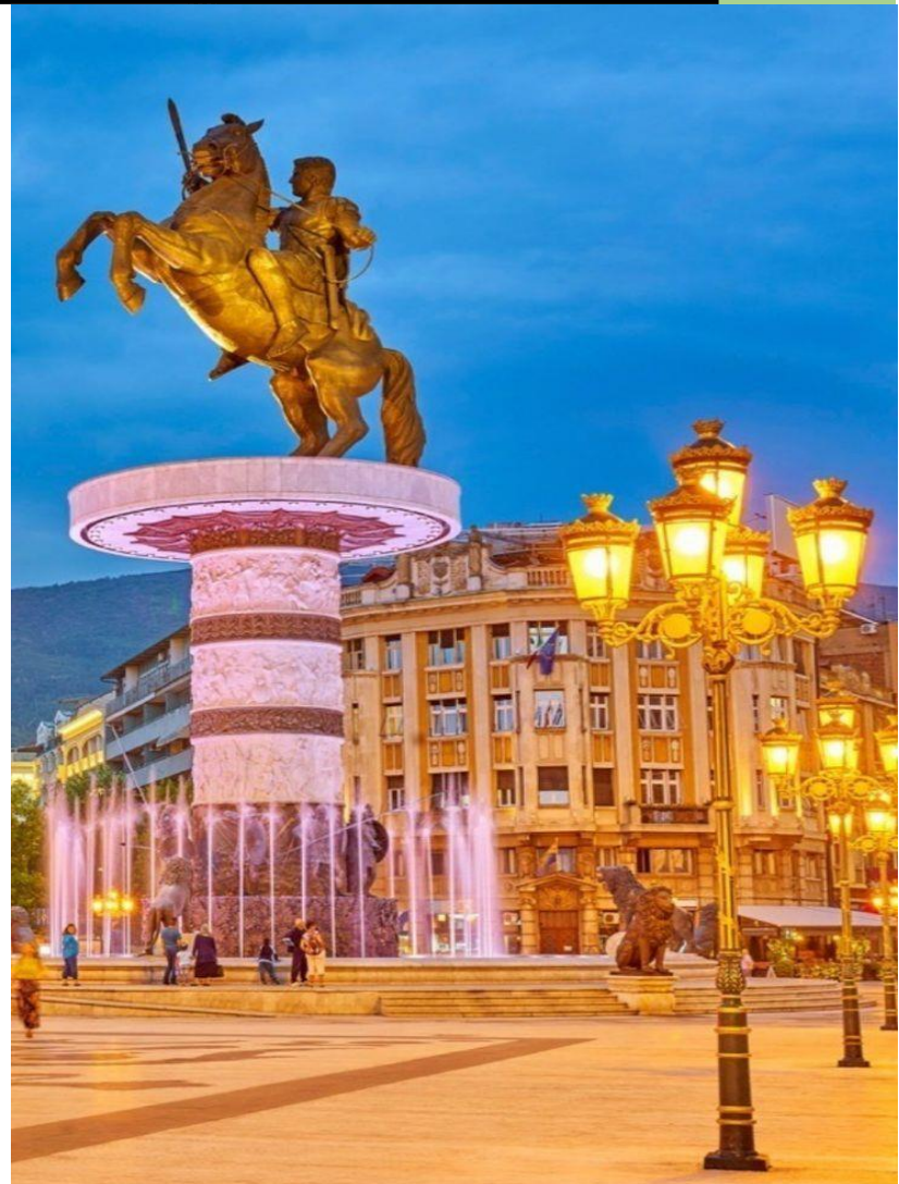
Alexander The Great, Skopje, Macedonia