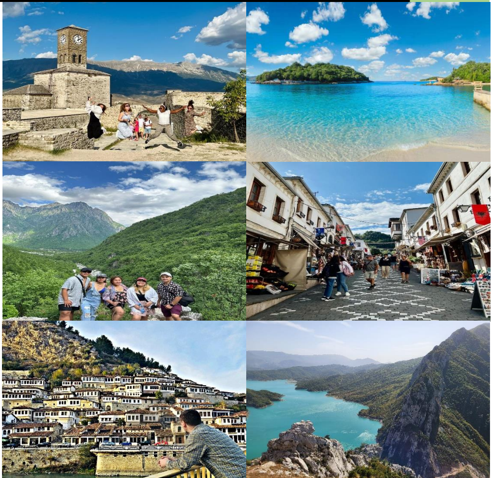
Photos from various locations in Albania